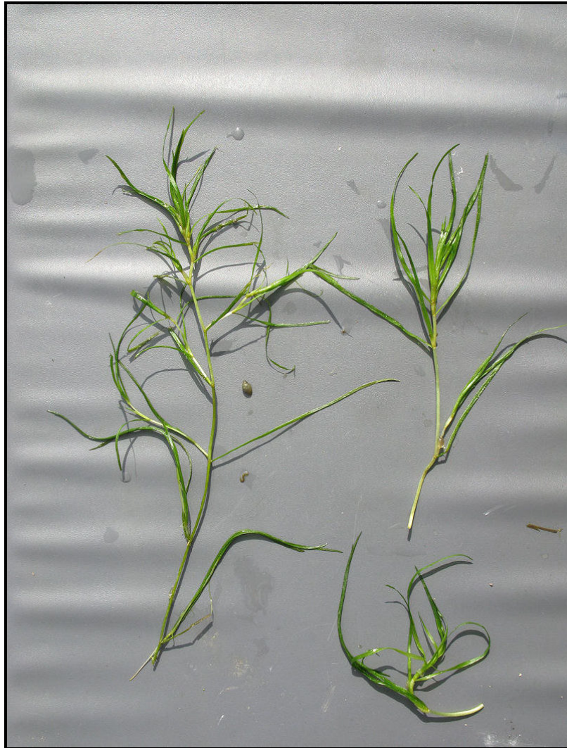
Figure 3: Upper part of Zannichellia major showing its wide leaves